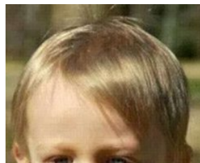
Commission probes 3rd child Ikea dresser death

I bought an AR-15 semi-automatic rifle in Philly in 7 minutes